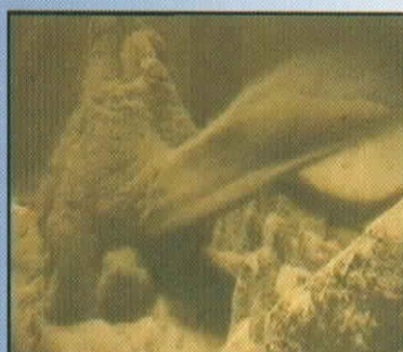
Cardox Tube is activated, releasing within a second a powerful heaving mass of cold CO 2 that expands 600 times its original volume.