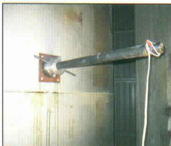
Cardox tube is placed in the tube holder, inserted and then secured in the socket. The tube is then activated.