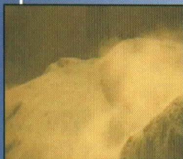
Cardox clears the build-up and aerates the product to produce a free flowing product.