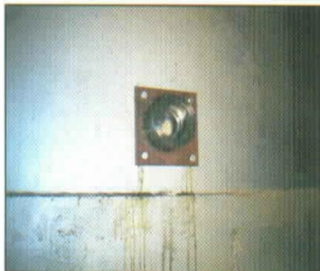
Before: Plug is removed to reveal build up of product