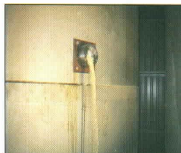
After: The tube is removed to reveal build-up has been cleared and product is aerated and once again free flowing.